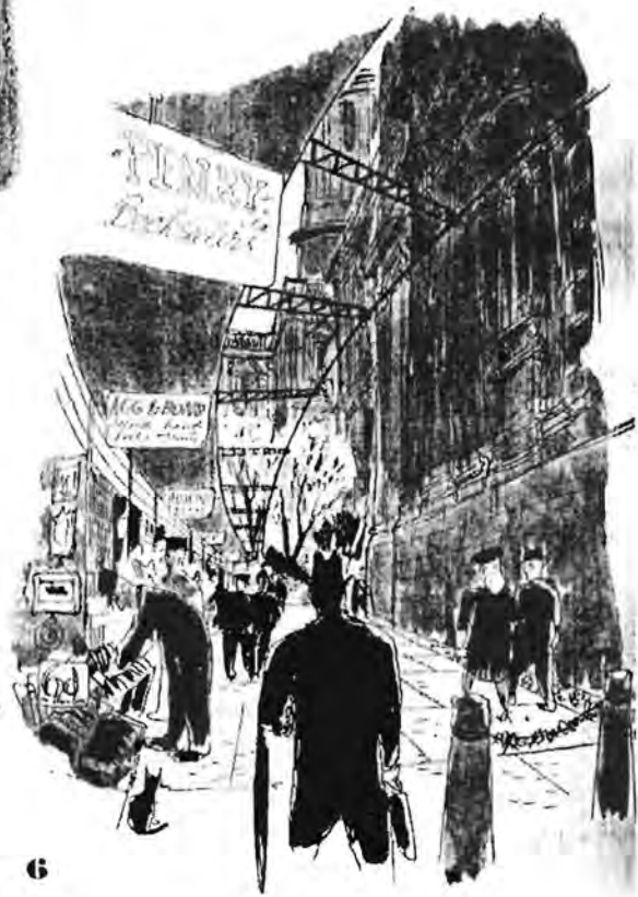
Fig. 2: "Precinct of St. Paul's," Hugh Casson drawings, from "A Test Case - The Precinct of St. Paul's" The Architectural Review , 97 (1945), p.190.